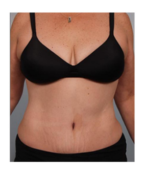
Do not Assume they are sized symmetrically