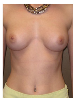
Do not Just crop to the same size and ignore body positioning