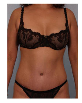
Do Rotate images as needed, crop any borders, and separate the images into individual files