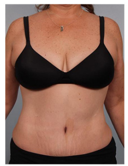
Do Crop each before & after set to the exact same dimensions